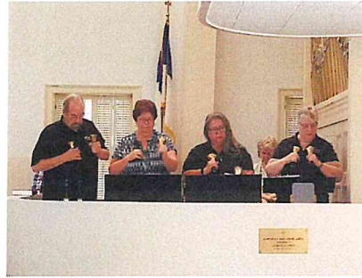
Westwood Ringers' Quartet